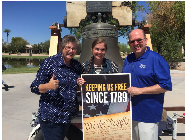
Constitution Day 2016 Arizona Liberty Bell