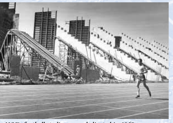
MCC's football stadium was dedicated in 1969.