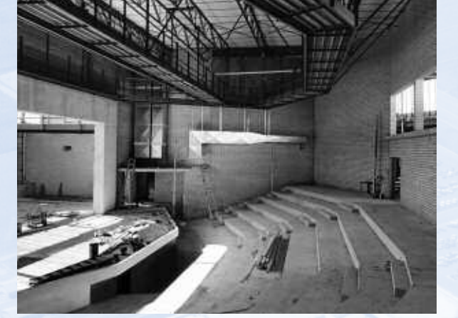
Construction of the Theatre Outback began in 1976