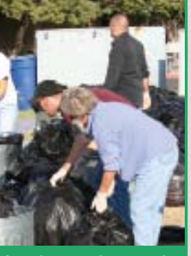
<u>Students donned masks and rubber gloves as they sorted</u> through a day's worth of the college's trash collection to identify materials that could be recycled rather than thrown away.

In downtown Mesa, MCC's new campus is already a reality, with exciting developments made possible through community partnerships and the use of $10 million in bond money. The downtown campus integrates MCC health and fire safety courses and offers MCC students seeking bachelor's degrees access to a four-year program offered through Northern Arizona University.