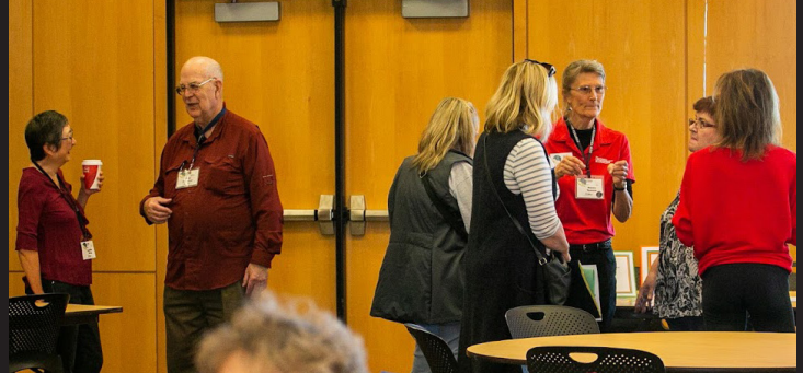
All attendees had the chance to talk with Class Instructors/Facilitators.