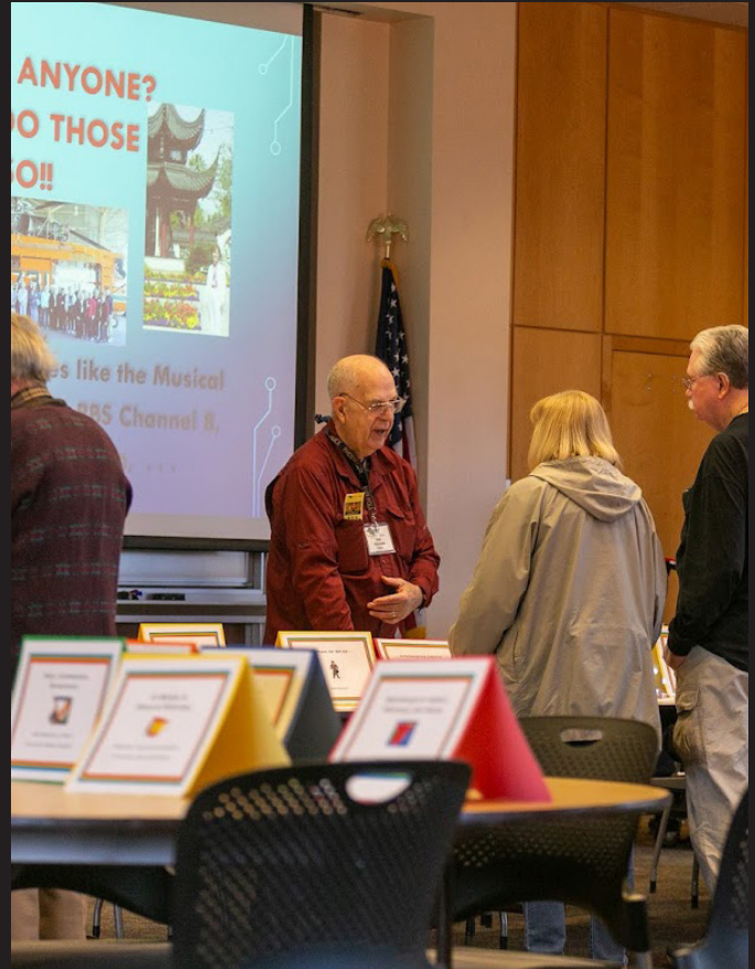
New members first came to Room M200, at the MCC Red Mountain campus.