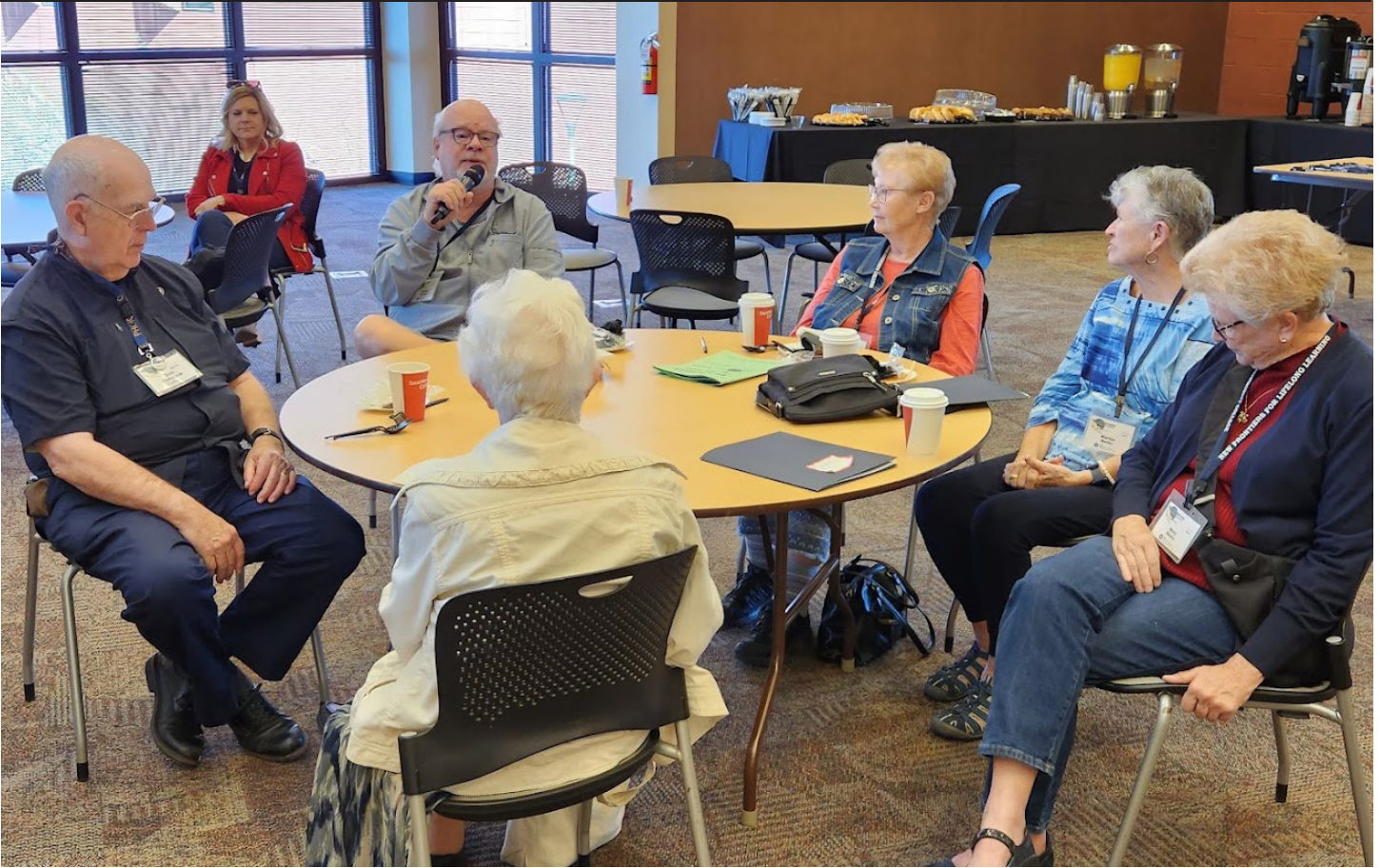
Getting to know New NFLL Members at the New Member Coffee!