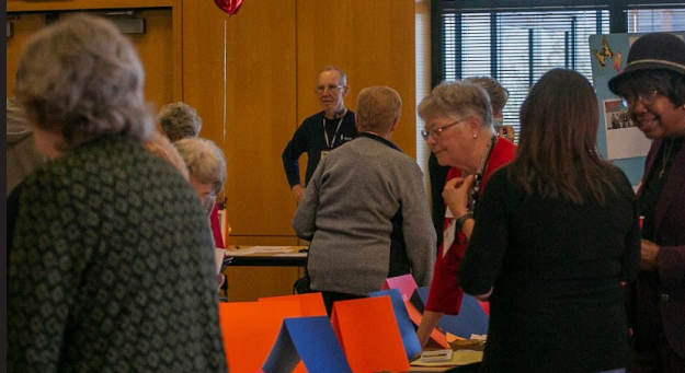
New members received an Orientation package and had refreshments.