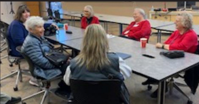
They followed color-coded footsteps to the elevator, down to the ground floor, and to the public computer room where they attended Orientation, Registration, and Pre-enrollment.