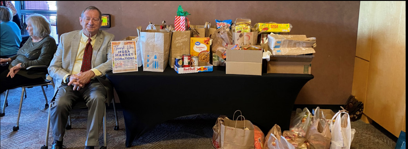
Greg Master watched over the food donation table. We filled the table 3 times & collected hundreds of items for MCC's Food Pantry.