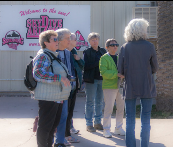
NFL members headed to Eloy to see the skydivers.