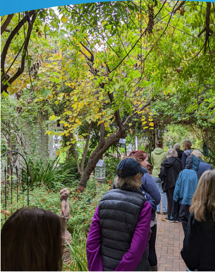
The Amazing Local Gardens class included tours of valley homeowners' gardens.

The current Spring 2023 Schedule has over 70 courses with a variety of topics from history, social sciences, discussion, literature, nature, travel, technology, arts, finance, health, and just fun. Courses are being offered in-person, online and in some cases both. Courses include single session courses and several multi-session ones. Several courses are repeats from previous terms held on a different campus to allow access to more members. Leisure World, Aster Center Downtown, and Venture Out Resort will host off-site programs. As usual, our hiking, walking, and cycling groups will be continuing throughout the months. New this term is two Tai Chi sessions to be held on the Dobson Campus.