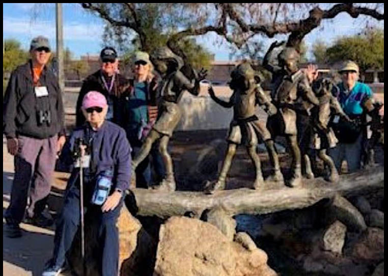
The Walking Group tackled Desert Breeze Park in Chandler.

Check out pictures of many of our activities at: https://newfrontiers.mesacc.edu/photos-2022.html