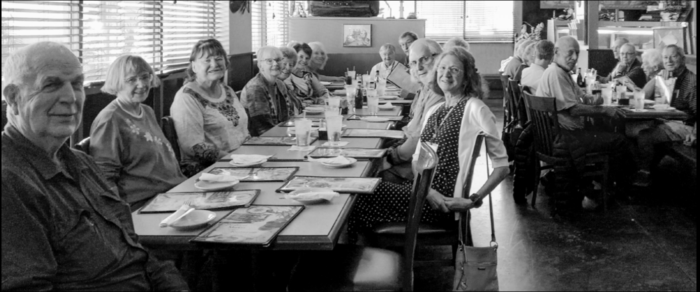
Great "out to lunch" group at the Seafood Market in Mesa.