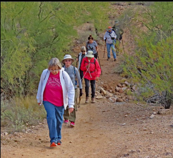
Hiking Blevins Trail at Usery Park.