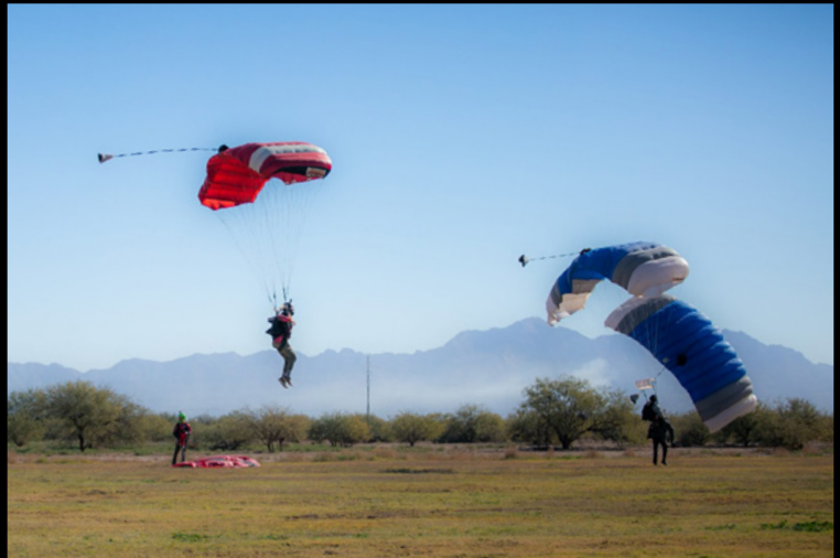
Skydivers in action.